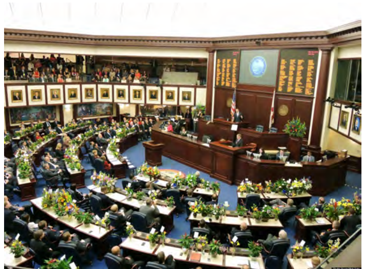
Florida House of Representatives in session.